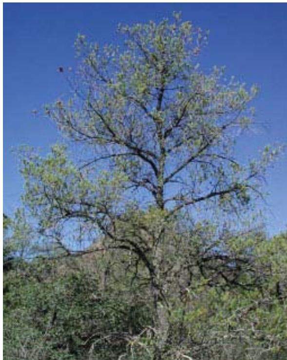
Figure 1. Fading pinyon pine with needle scale.

Pinyon needle scales ( Matsucoccus acalyptus ) are very small (0.5 mm) sucking insects that feed on pinyon, singleleaf pinyon, and foxtail pines in the southwestern United States. Outbreaks of these native insects occur in both naturally occurring stands and ornamental plantings. The first noticeable sign of pinyon needles scale colonization is an overall thinning of the foliage leaving only tufts of needles at the branch tips (Figure 1). Repeated colonization weakens and frequently kills small trees. In addition, pinyon needle scale may predispose larger trees to colonization by other insects, primarily pinyon pine engravers ( Ips confusus ).