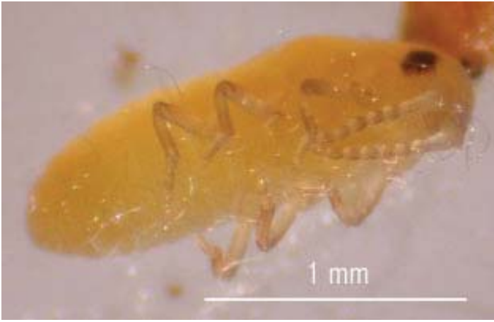
Figure 3. Pinyon needle scale crawler.

with a wax coating, and turn black. In central and northern Arizona, this normally occurs in late May or early June. The scales remain as small (1 to 1.5 mm) black beans (second instar nymphs) that are attached to the needles throughout the winter (Figure 4). By early spring, the nymphs resume development, change into adults, and move to the trunk, tree base, and larger branches. These adults mate and lay cottony egg masses to begin the next generation.